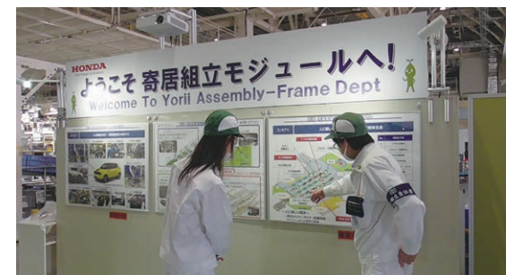
Inspection visit to Saitama Factory's Yorii assembly plant

Honda arranges inspection visits as necessary to plants and other business sites to promote an understanding of its business.