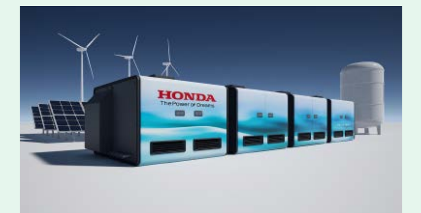
Fuel Cell Backup