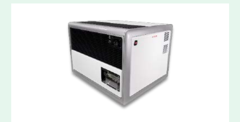
Portable Power Supply