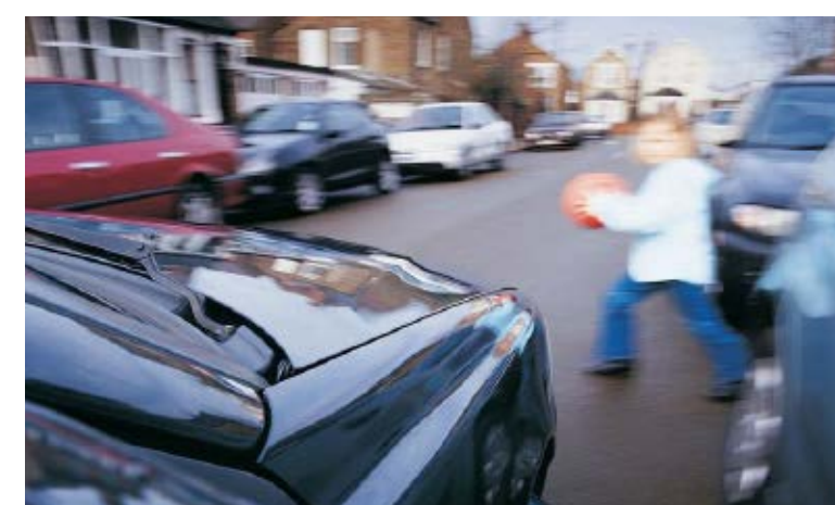
Dashing out onto the street