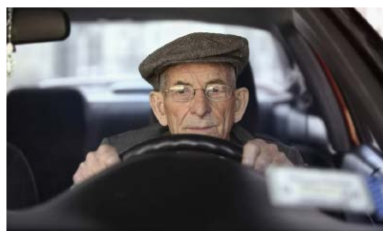
Decreased functions/ Changes in physical condition

Respond to the different needs of each person depending on the situation while focusing on peace of mind in daily driving.