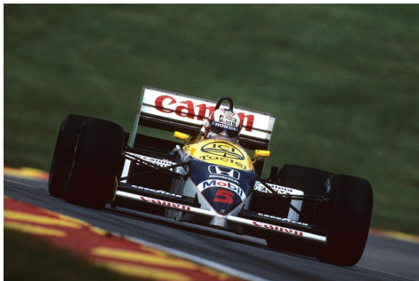
The FW11 on track in 1986

The first championship title in Honda's F1™ history was a major milestone that symbolized its spirit of challenge. To commemorate the 40th anniversary of this achievement, Honda will look back on the history of its challenges and victories in F1™ while conducting a global showrun program featuring the Williams Honda FW11*3 (FW11) to celebrate with motorsports fans around the world.