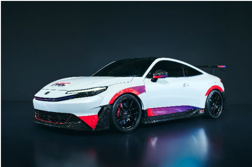
PRELUDE HRC Concept