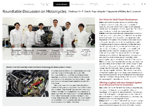
Roundtable with the motorcycle development team

* Waigaya: A unique communication culture of Honda, in which individual associates transcend their respective roles and positions, and engage in vigorous exchanges of their opinions that yield higher results.