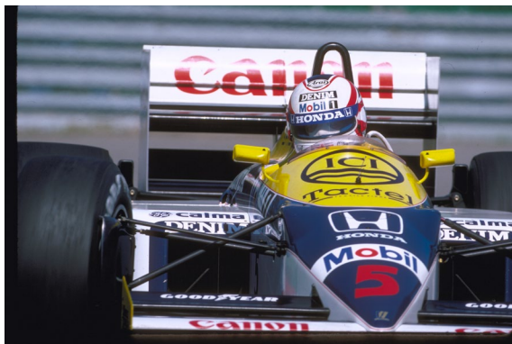
Nigel Mansell driving the FW11 (1986)

The 2025 Goodwood Festival of Speed will celebrate the 75th anniversary of F1 and the 125th anniversary of motorsports, with the theme "The Winning Formula – Champions and Challengers." The FW11, which will participate in the showrun, is powered by the Honda-developed RA166E, a 1.5L V6 twin-turbo engine, said to have produced more than 1,050 horsepower. In 1986, it powered Williams Honda to nine wins out of 16 rounds, claiming Honda F1's first Constructors' Championship title. To mark this occasion, the car will be driven by its original driver, Nigel Mansell, following several months of meticulous, period-correct restoration by Williams Heritage *4 . This FW11 is also scheduled to participate in a showrun at the Monterey Car Week 2025, an automotive festival held in California, USA, in August.