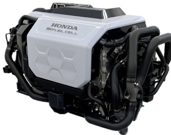
The Next Generation Fuel Cell