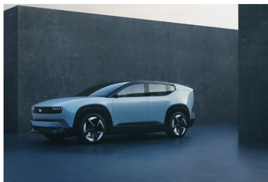
Honda 0 SUV Prototype

These models feature ASIMO OS, the original Honda vehicle OS, which will enable continuous advancement of various functions even after the purchase of the vehicle. So, the more the customer uses it, the more personalized the car becomes to offer “ultra-personal optimization” of the customer’s mobility experience.