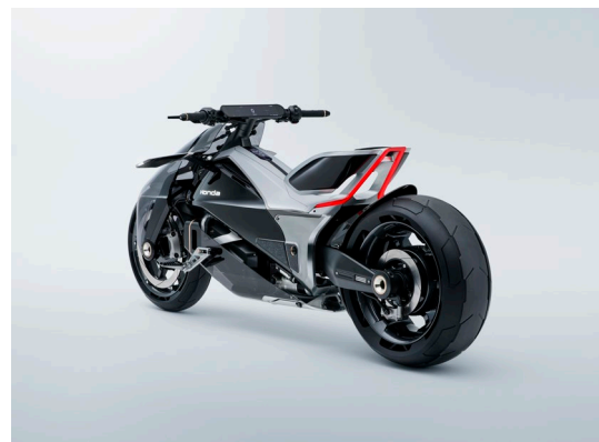
EV OUTLIER Concept