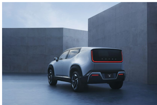
Honda 0 α Prototype