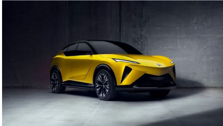
Acura RSX Prototype *The model on display will feature a different color.

The Acura RSX Prototype is the first model to adopt the next-generation EV platform developed independently by Honda. It also features ASIMO OS, the original Honda vehicle OS, which will enable the vehicle to learn the preferences and driving patterns of each customer and realize “ultra-personal optimization” of the mobility experience.