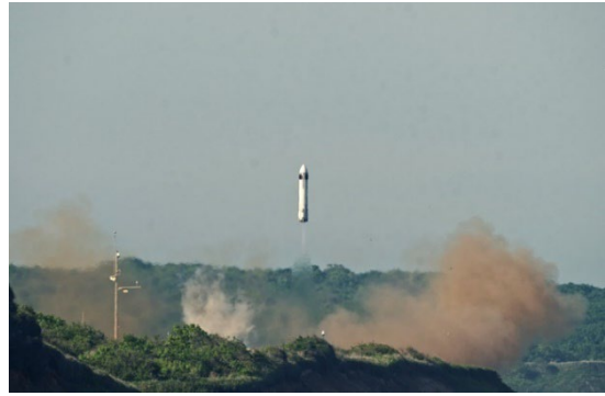
Actual launch and landing test in June 2025

In the testing in June, precise control was applied on the rocket's attitude and speed from takeoff to landing, to achieve the exact rocket behaviors planned.