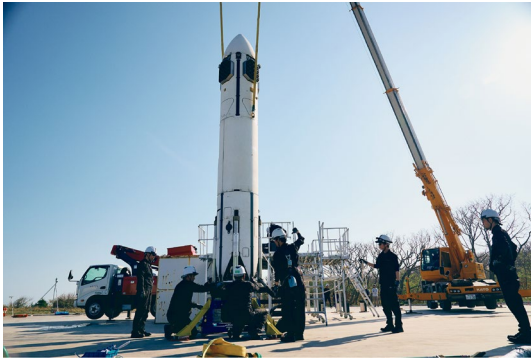
Test being conducted in Hokkaido, Japan (Photo taken in May, 2025)

The actual rocket Honda used for the launch and landing test conducted in Hokkaido, Japan in June 2025 is also on display at the Honda booth. Honda is striving to develop environmentally-responsible “sustainable rockets” which will enable the reuse of the rocket as well as the use of renewable fuel.