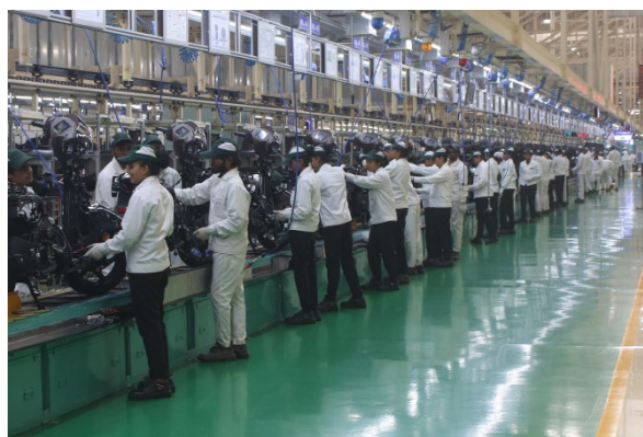
Motorcycle production line in HMSI Fourth Plant

HMSI currently has four production plants in India with a total annual production capacity of 6.14 million units. In addition, the cumulative production volume reached 70 million units in April of this year, after 25 years since start of production in 2001.