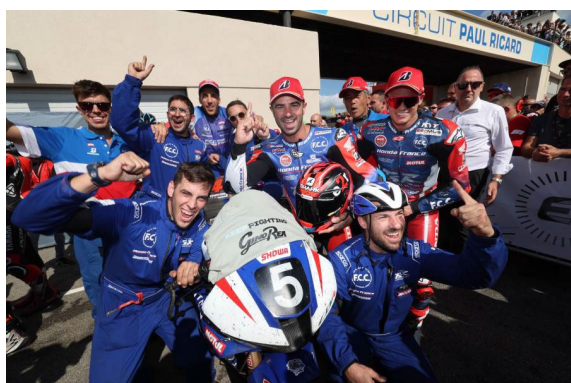
F.C.C. TSR Honda France

* FIM: Fédération Internationale de Motocyclisme