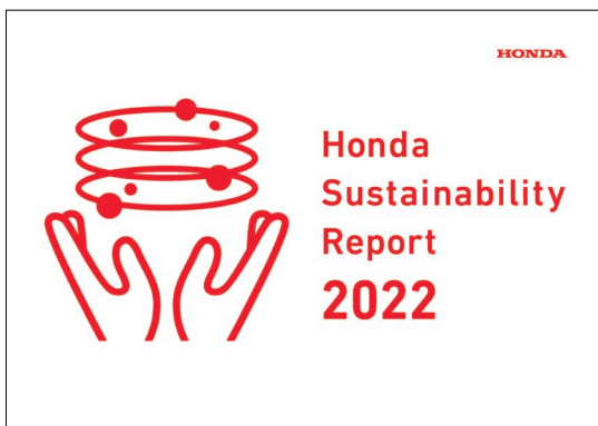
Front cover of Honda Sustainability Report 2022

In an effort to further enhance the transparency and credibility of its disclosures, starting this year’s report, Honda expanded the scope of third-party assurance to cover disclosures related to societal issues in addition to environmental disclosures. The report also introduces the Honda Human Rights Policy, which Honda newly established to ensure fulfillment of its responsibility to respect the human rights of all stakeholders affected by its business activities, based on Honda’s Fundamental Beliefs that include “Respect for the individual.”